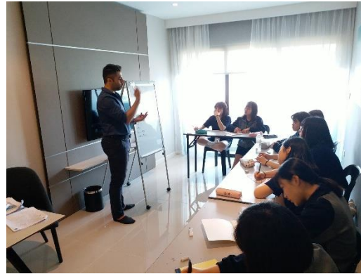
Korean High School Camp