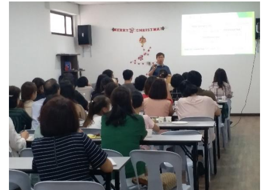
Korean University Open day