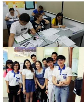
Korean Language Training