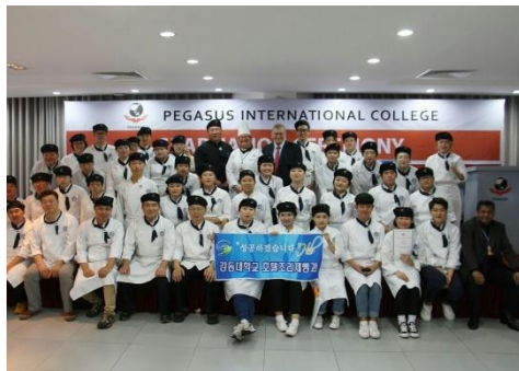
Korean College Students Camp