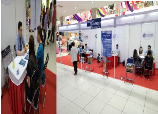
Korean University Fair (In JB)