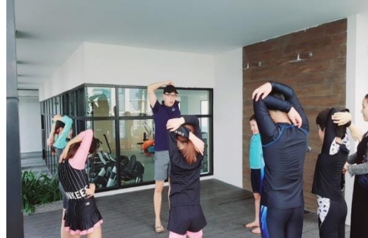
International School Camp