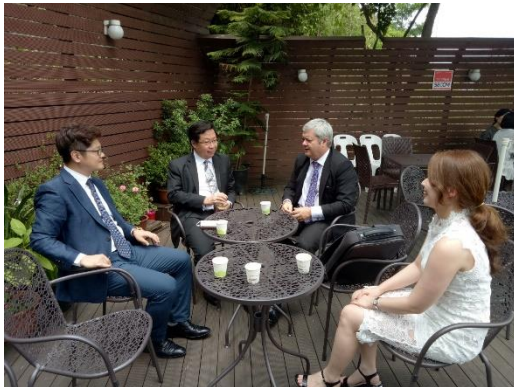
Matrix International School's Visit