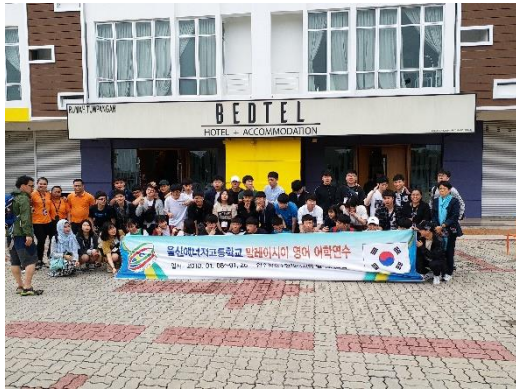
Group Workshop from Korea