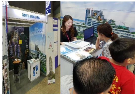
Education & Immigration Fair