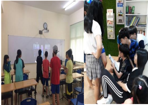
International School Camp