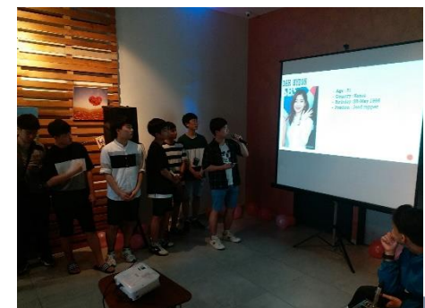
Culture Exchange Event