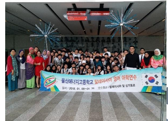
JB College Visit