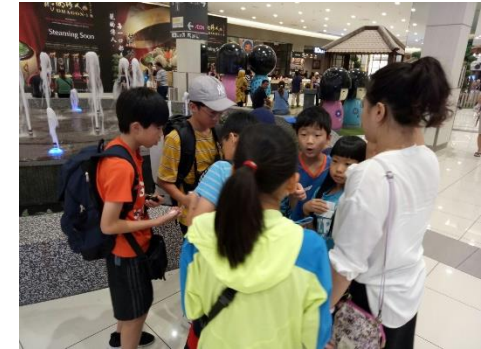
International School Camp