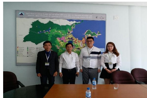
MOU Ceremony (Danang)